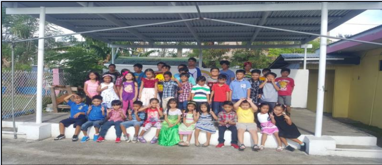
Before Typhoon Yutu